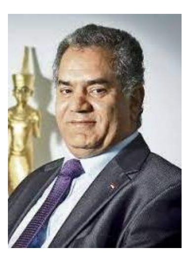
H.E. Mamdouh El Damaty, Former Minister Ministry of Antiquities